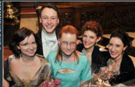
Handel's Singing Competition 2016 Finalists

A concert of vocal solos and ensembles from 17th and 18th century Italy, to include music composed for the 'Concerto