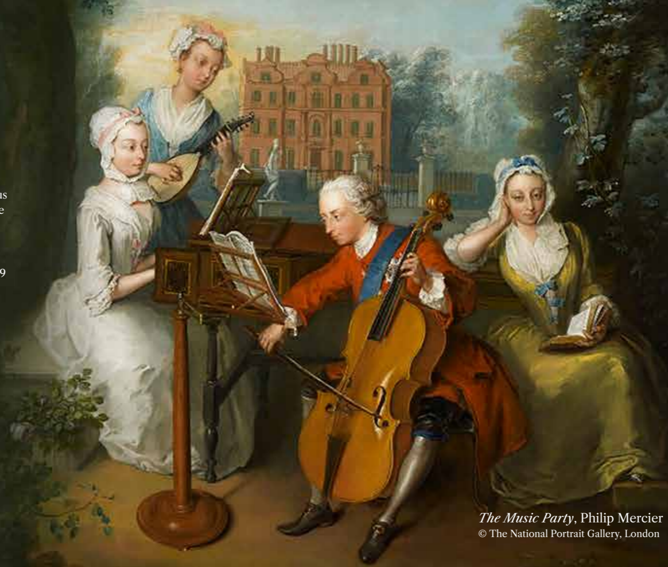
The Music Party , Philip Mercier