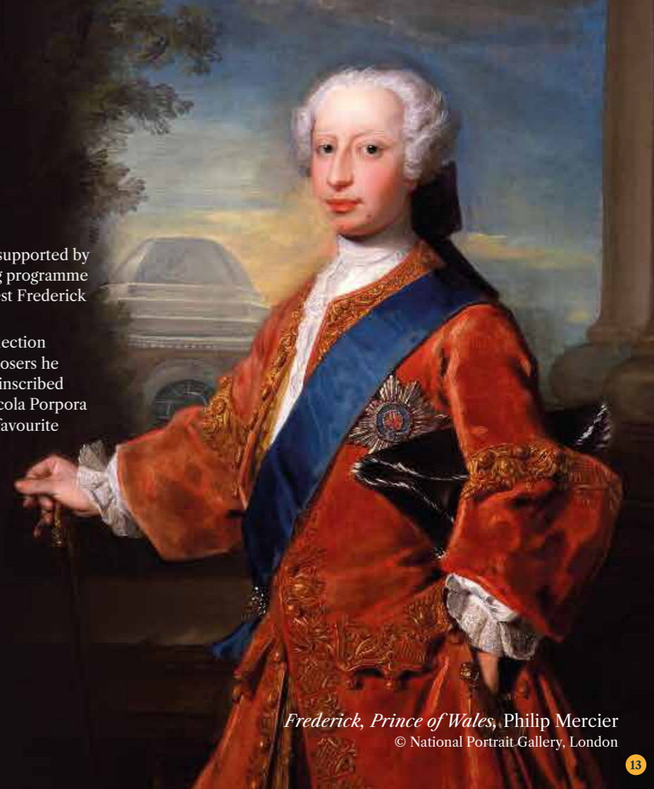
Frederick, Prince of Wales , Philip Mercier